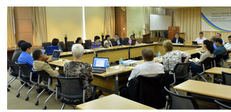
Exclusive session for UNEVOC network representatives