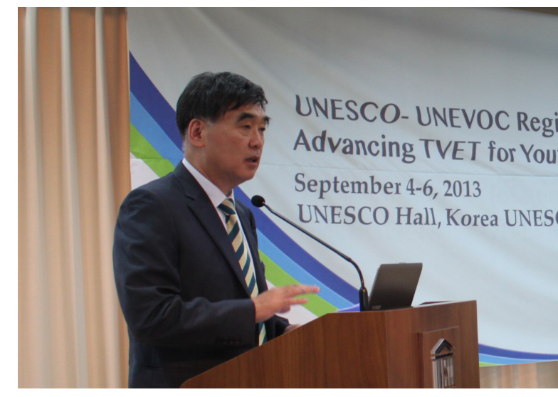
Mr Young-bum Park, President of KRIVET, Republic of Korea

r Young-bum Park, president of KRIVET, Republic of Korea, welcomed the delegates and reflected on the challenges young people are facing today, emphasizing the growing labour shortages and skills mismatches in the regional labour market. He also referred to increased global competition, a robust resource sector, and new technologies as some of the major forces rapidly reshaping today's regional economy. The greater landscape of transition from school to work, and a high level of interest in sharing relevant policies and strategies for all regions with global TVET players, were aptly mentioned.