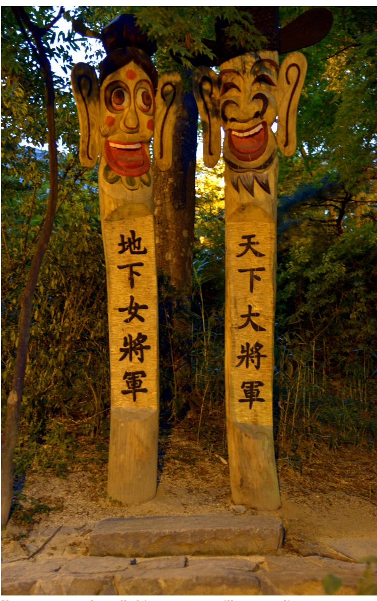
Korean totem poles called jangseung or village guardian traditionally placed at the edges of villages to mark for boundaries and frighten away demons.