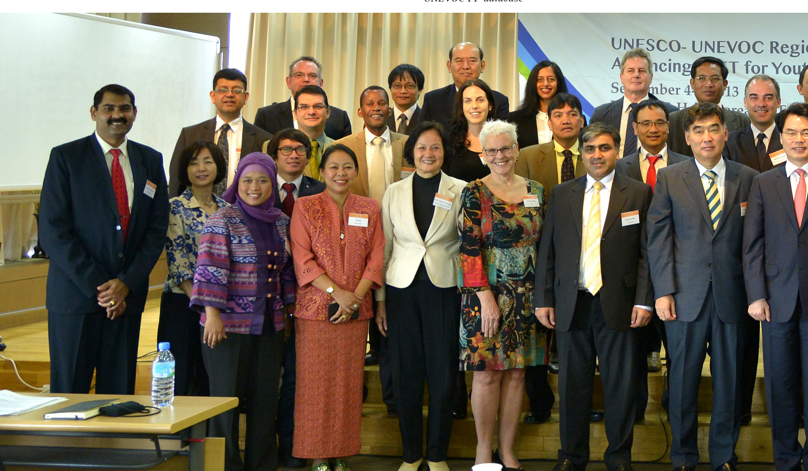
Participants of the Asia Pacific regional forum

1 The documents presented at the forum are potential promising practices and are under consideration for uploading in the UNESCO-UNEVOC PP database