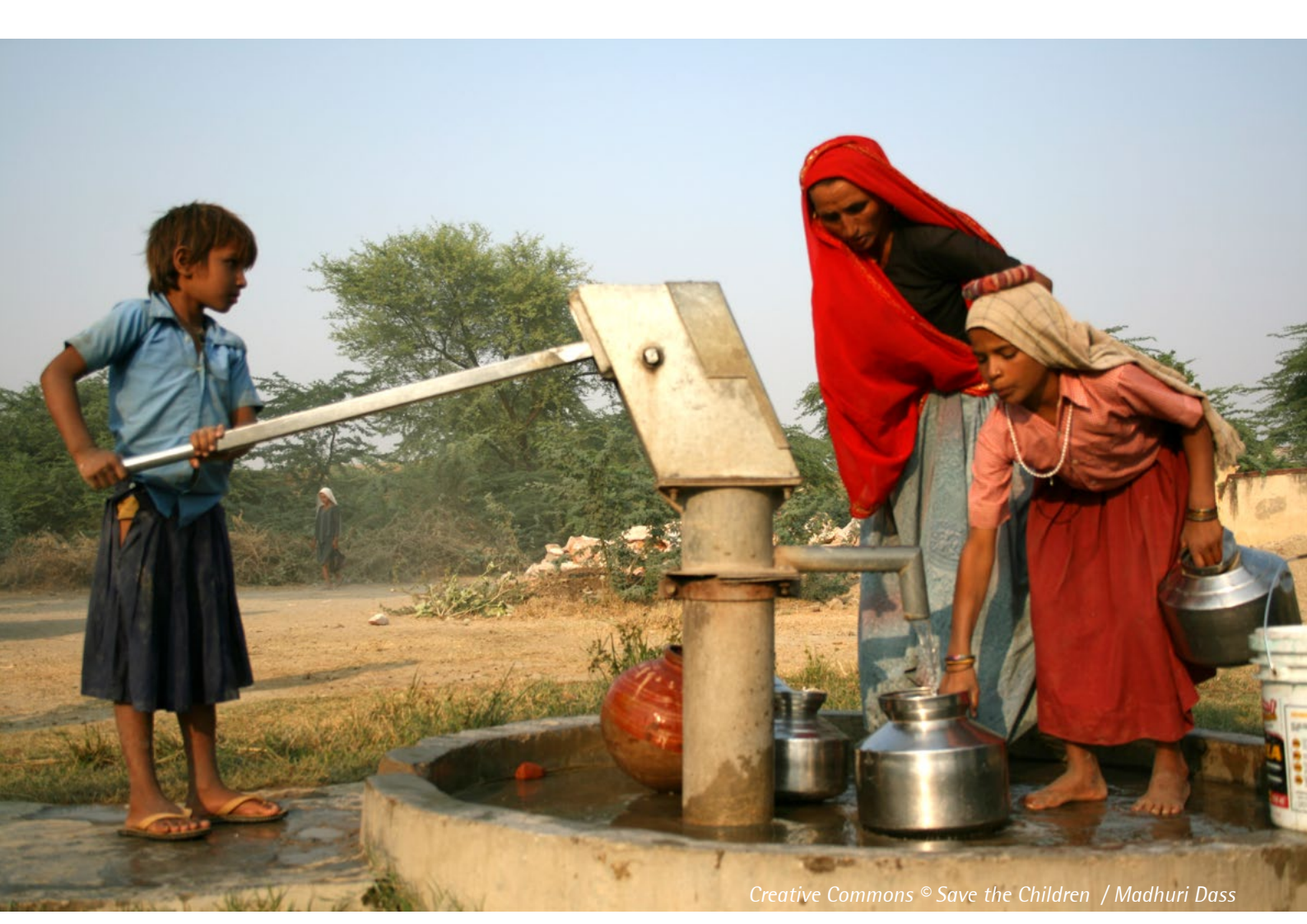
Conclusions and recommendations

The virtual conference provided a unique platform to share knowledge and experience on GTVET. All participants confirmed the importance of GTVET. It became evident that Corporate Social Responsibility (CSR) and SD are an integrated part of improving the competitiveness of the enterprise, not only in large companies but also in the predominantly small- and mediumsized companies of the handicraft sector. In addition, the acquisition of green skills increases the potential of localities to support the expansion of green economies.