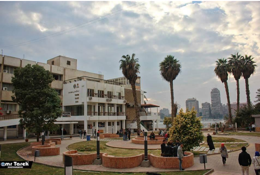
Campus of the Faculty of Tourism and Hotel Management