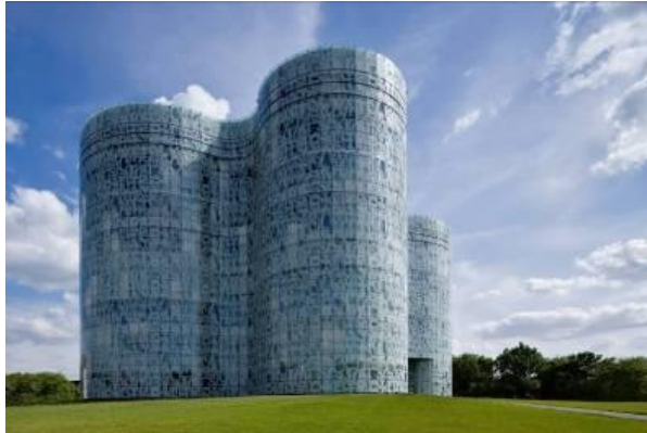
Information, Communication and Media Centre