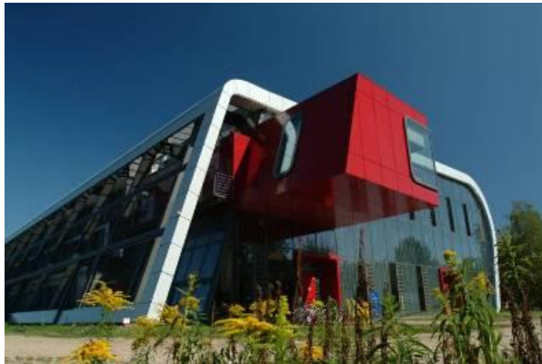
Panta Rhei – Research Centre for Lightweight Materials