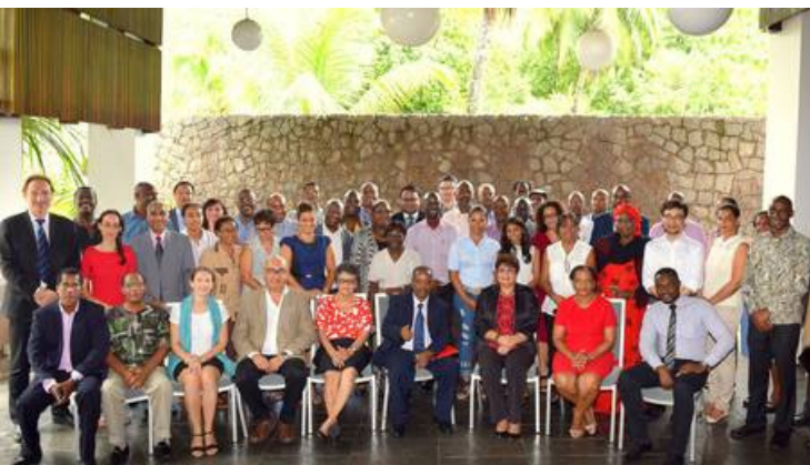
Regional forum in Mahe, Seychelles in March

As well as reviewing key trends in TVET in the region, the experts discussed areas such as how TVET can contribute to sustainability and economic development. Lines of action on labour qualification systems, educational curricula, financing and the social responsibility of TVET were also on the agenda.