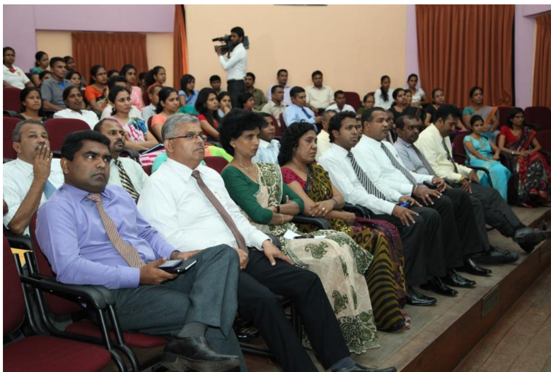
Picture depicts part of the invitees from TVET providers and decision makers of the Ministry and TVEC.