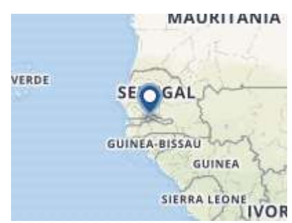
Data © OpenStreetMap Design © Mapbox

1,991,000 (2015) 390,000 (2015) 16.8 (2015) 3.24%